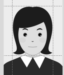
Examples of Acceptable photo Images